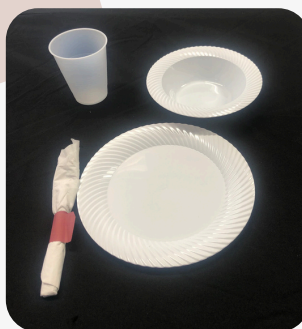
Disposable tableware included with all meals